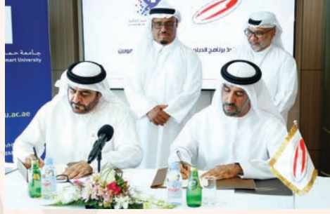
Agreement to Implement Vocational Gifted Education Diploma