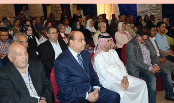
Egyptian Vice Minister of Interior: Hamdan bin Rashid dedicated his life to serve poor and needy people, science and scholars